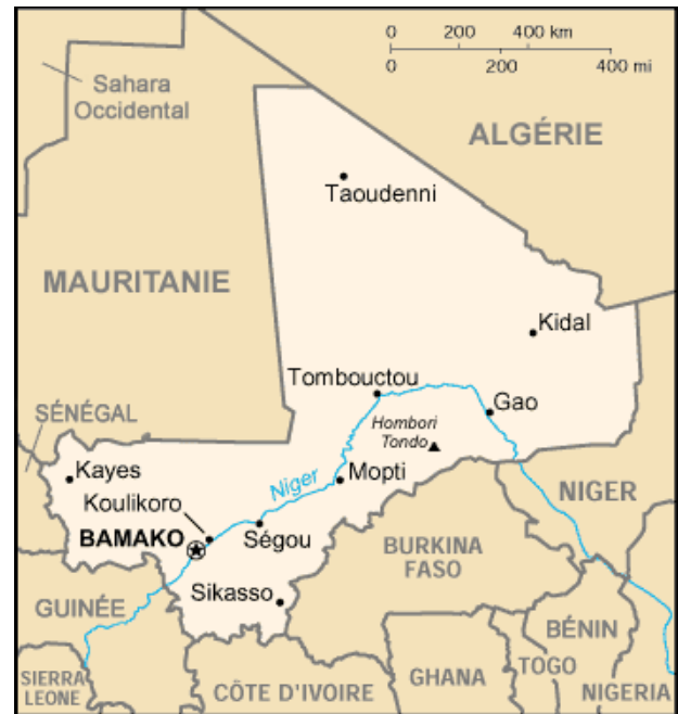
Figure 1. Location on the map.

The Malian health care system is organized on the basis of the country's administrative division into eight regions plus one district (the capital, Bamako). Each region is made up of several circles (or prefectures) made up in turn of several towns. The health-care system is therefore built like a pyramid with a central level involving National Reference Hospitals, an intermediate level involving Regional Reference Hospitals (seven in all), and the lower level made up of health care districts in the circles. In spite of this meshed